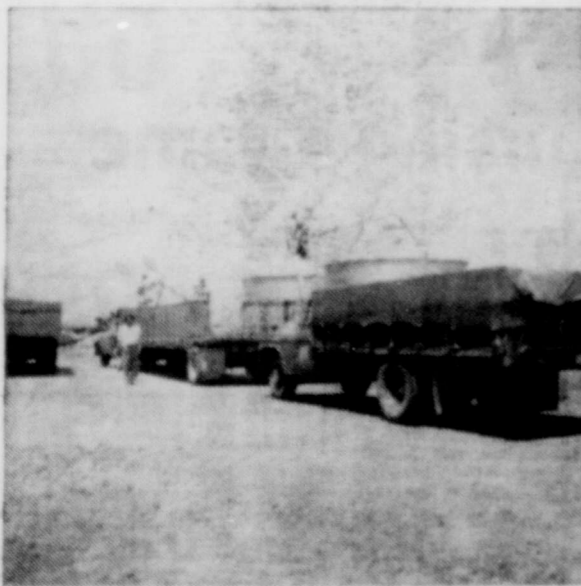
MOVING 1964 WHEAT CROP—Bill Bufe is shown here standing beside two large trucks as they are being loaded from grain storage bins getting ready to leave on another trip in moving the record 1964 wheat crop handled by Service Mill in Priddy. Service Mill moved 2,000,000 pounds of wheat in a three week period. Bulk of the crop was moved in 10 days.

Your cooperation during the 1964 harvest season as we moved two million pounds of wheat was certainly appreciated.