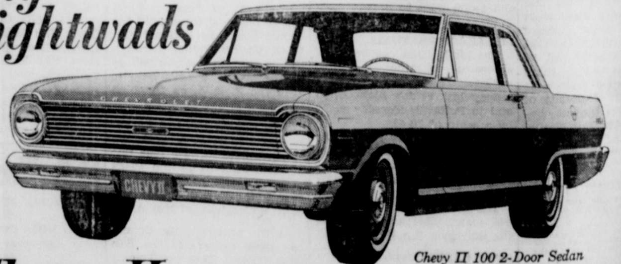
Chevy II 100 2-Door Sedan