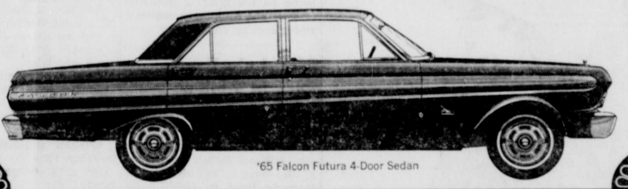
'65 Falcon Futura 4-Door Sedan