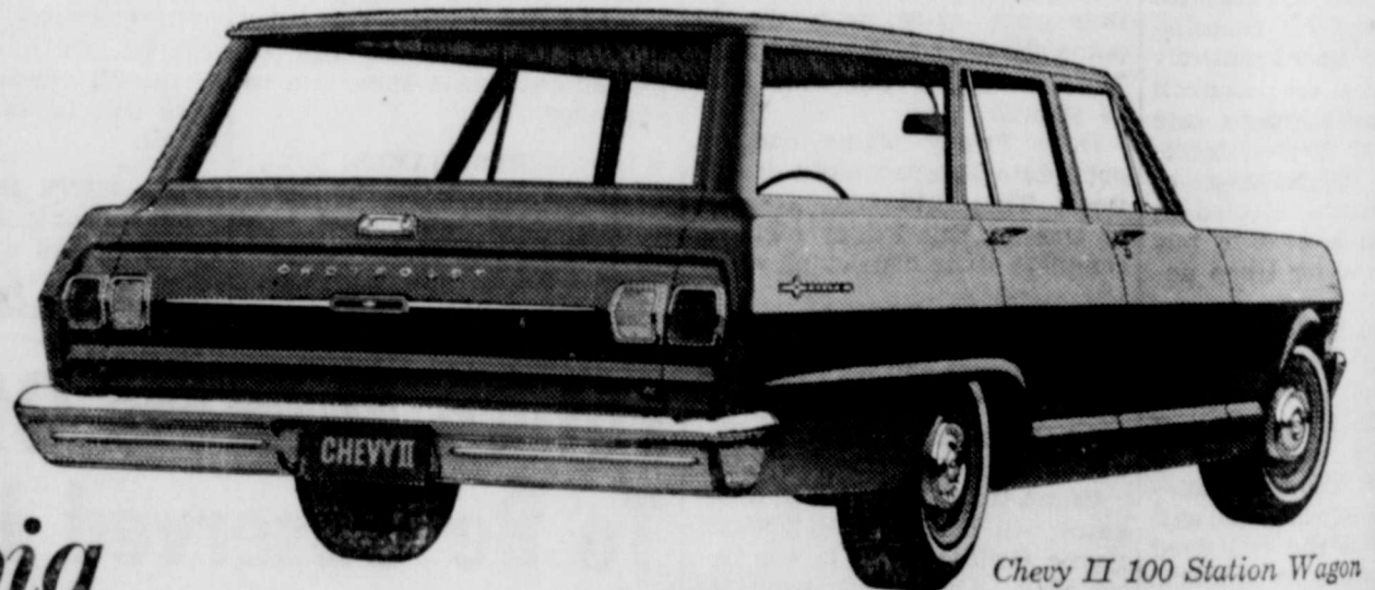
Chevy II 100 Station Wagon