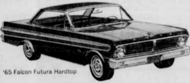
'65 Falcon Futura Hardtop