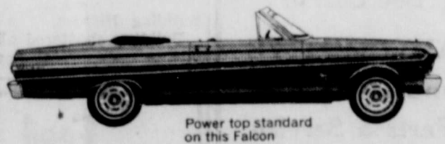
Power top standard on this Falcon