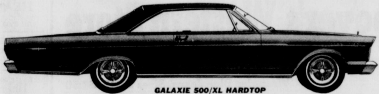
GALAXIE 500/XL HARDTOP

Save now on full-size Galaxies and Customs! Fairlanes and Falcons, even luxury Thunderbirds! Low, low year-end prices! Something for everyone! Finance plans to please your budget! Large stocks — wide choice of models, colors, equipment! Immediate delivery! First come—first served!