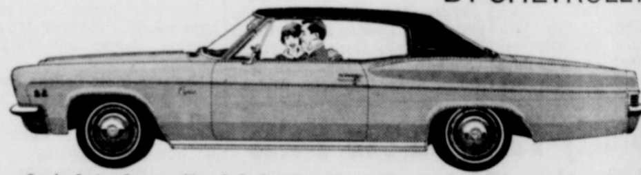
Caprice Custom Coupe—with exclusive formal roof line that comes on no other Chevrolet.