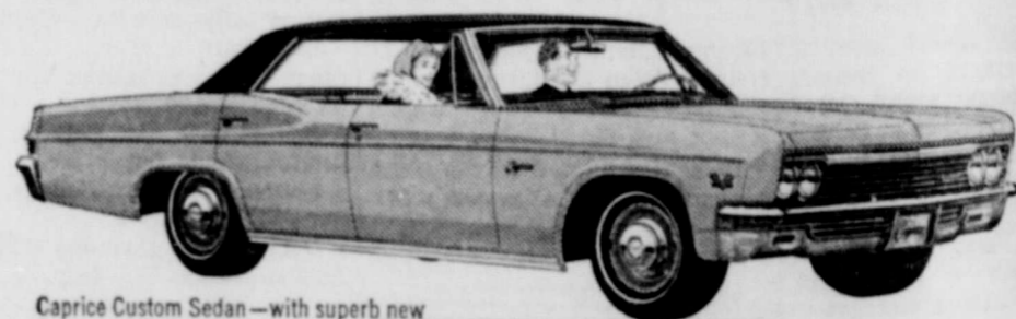
Caprice Custom Sedan—with superb new Body by Fisher elegance inside and out.