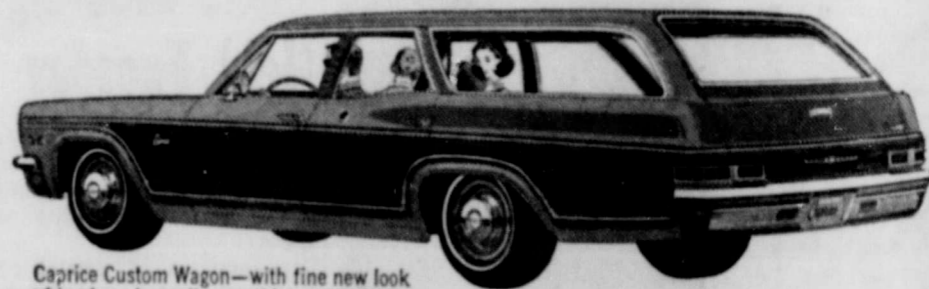
Caprice Custom Wagon—with fine new look of hardwood paneling on sides and tailgate.

Everything it takes to create a distinguished luxury car has gone into these new Caprices.