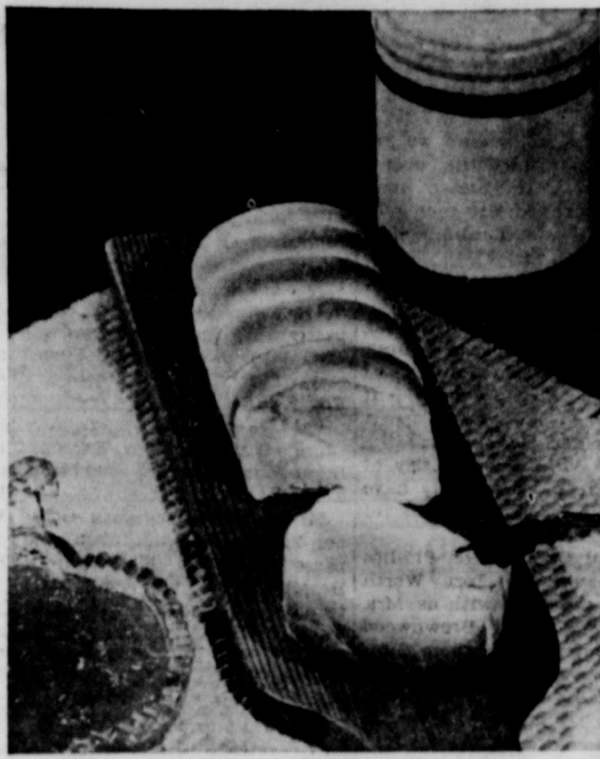
HOT HOME BAKED BREAD , is delighting more families these days thanks to Mrs Baird's Pul-A-Part Bread. This new product is not frozen, but comes ready to bake. Now available at your favorite food market.

Bobby Johnson Texaco Station Fisher and Sixth Phone 648-7202