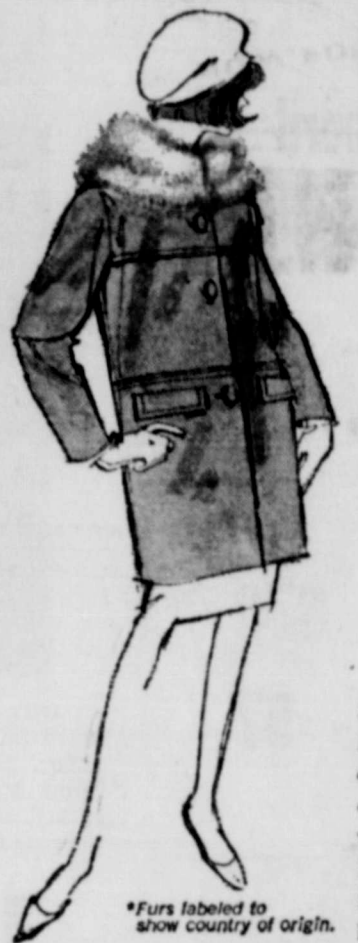
*Furs labeled to show country of origin.