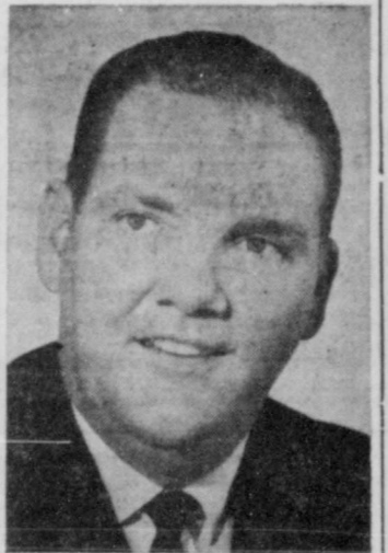
SEN. J. P. WORD ... Seeks Re-Election

nouncement for election to the Senate, I stated that I disapproved of deficit spending, and thought that we should live within our means. Our state government has operated in the black since I entered the Senate, and this is among the accomplishments of the Legislature that have been most gratifying."