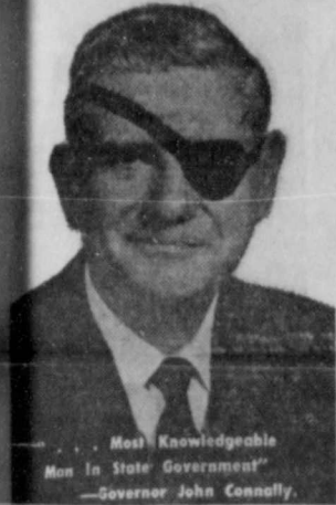
Most Knowledgeable Man in State Government—Governor John Connally

VOTE MAY 7 FOR A VOICE OF EXPERIENCE AND INTEGRITY FOR TEXAS!