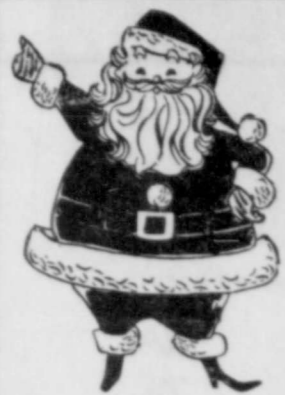
Santa Says -- --