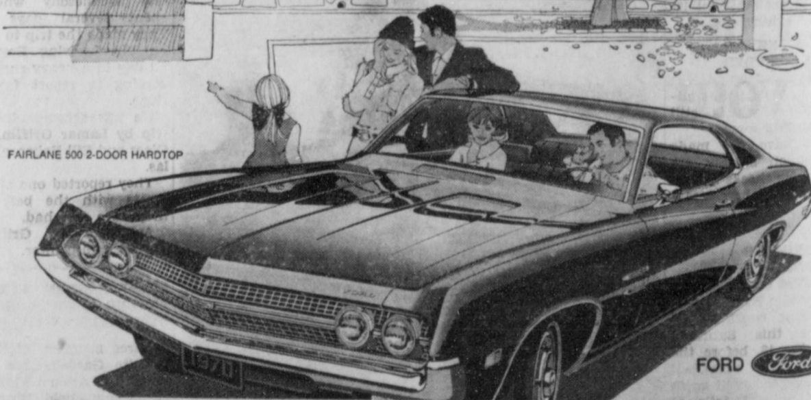
FAIRLANE 500 2-DOOR HARDTOP

For more information about these cars, see your Ford Dealer or write: Maverick Catalog, Dept. N-8 or Torino Catalog, Dept. N-9, P.O. Box 1503, Dearborn, Michigan 48121.