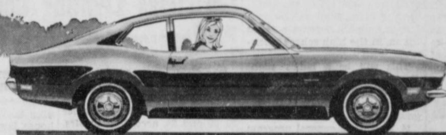
MAVERICK... THE SIMPLE MACHINE

Fisher Street Phone 648-2261 Goldthwaite, Texas