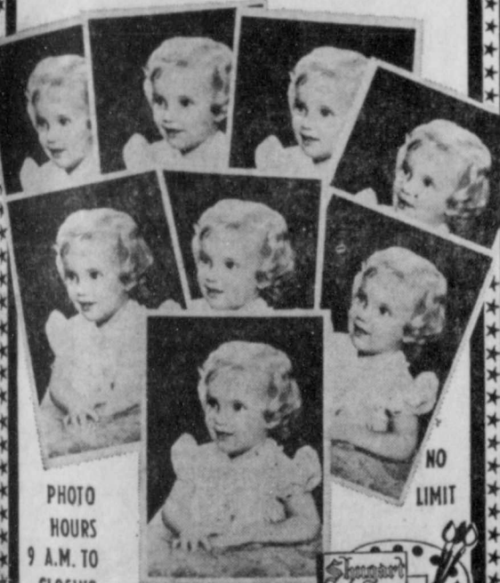
PHOTO HOURS 9 A.M. TO CLOSING

KING SIZE WALLET CREATIVE COLOR PORTRAITS FOR ONLY