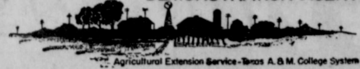
Agricultural Extension Service - Texas A. & M. College System

What a boon eggs are to family menus because they can be prepared in a dozen tasty dishes for a quick meal or they can be prepared well in advance of their need.