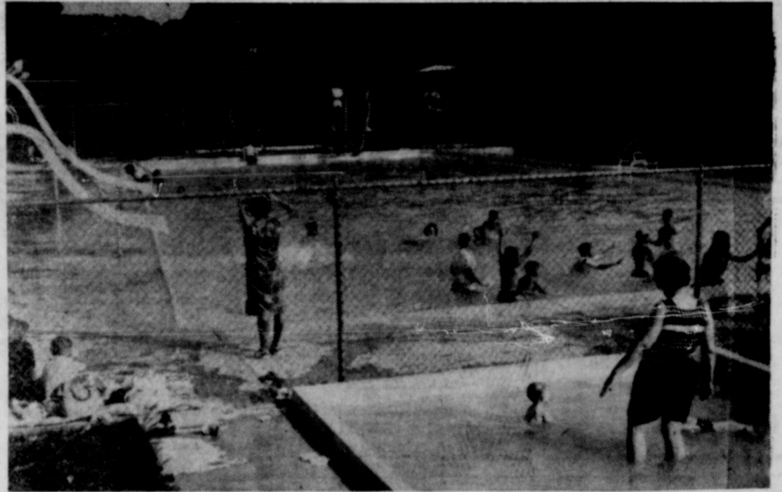
SWIMMIN' HOLE SCENE — Mills County Swimming Pool was real busy this past weekend as temperatures reached into the 90's. The pool opened May 25. Swimming lessons begin Monday for all children who wish to participate.

The theme of this year's state reading program is "Climb A Little This Summer".