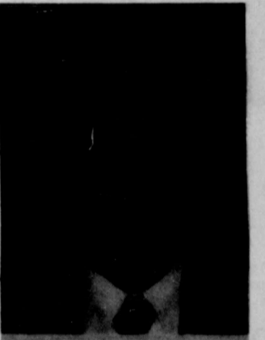
W. P. DUREN ... Chairman

The FHA girls and 4-H Club members of Mills County will have their food and clothing exhibits at their exhibition rooms in connection with the Mills Co. Livestock Show. The three divisions consist of food, clothing, and crafts. The craft division will include a class for adults. Also an adult canned goods division will be included in the show.