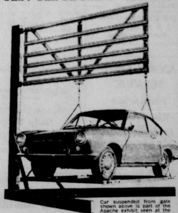
Car suspended from gate shown above is part of the Apache exhibit seen at the Southwestern Stock Shows.

Put Apache long-service features to work for you — Exclusive full-hard spring steel for the ultimate in durability. Hot-dip galvanizing to prevent corrosion. Tubular slide latch for ease of operation. Square-shouldered joints for maximum holding power. Bearing-type, Pressed Steel Hinges for effortless movement and life-of-the-gate service.