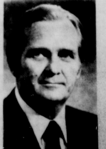
MARVIN LEATH ...Congressman

home districts. This is the first chance I've had to spend much time in Texas since the start of Congress in January and I plan to take full advantage of it," Leath said. Leath will hold 20 of the community meetings in addition to having a heavy schedule of speeches and other events. All will be crammed into a 10-day period, April 12-22, with time out to observe Easter. "It will mean many hours on the road, but I am looking forward to it," Leath said. "I hope to see a great number of people so I can get the thinking of a cross section of the folks in the 11th Congressional District."