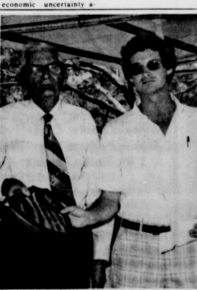
60 Years Service to Schools

Mills Co. - $7,462,108 Brown - $93,740,737 Comanche - $32,873,801 Hamilton - $17,999,046 Lampasas - $12,778,388 Mason - $5,709,736 San Saba - $8,384,414