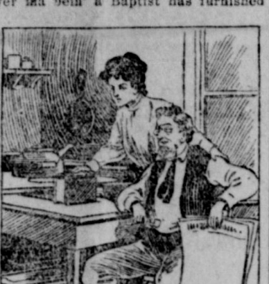
I Sez: Les Burn It.

"Elsie, it seemed jest like a ton of hay had been lifted off my chest right then. As fer your ma, why she jest busted down 'n' cried as hard as she could. After Doc. was gone we went out to the kitchen 'n' kneeled down right there 'n' thanked God fer the most glorious New Year's gift he ever gave 't anybody in 't world—the health of our baby girl. You know your ma ain't no rantier or shouter; yer ma bein' a Baptist has furnished