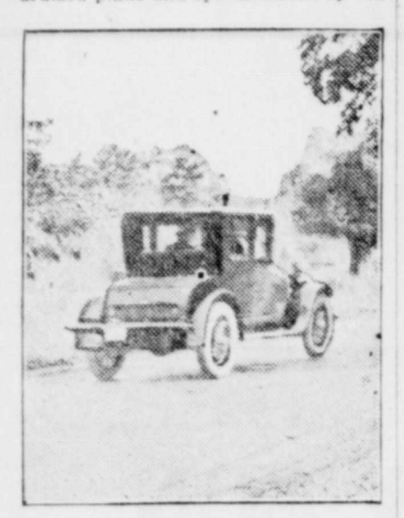
Improved Road in Indiana.

The regulation is similar to the federal order requiring the use of standardized plans and specifications by the