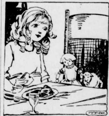
The Little Lamb Is There.

"Of course from Christmas to Christmas there are a number of old toys which have been broken, but there are