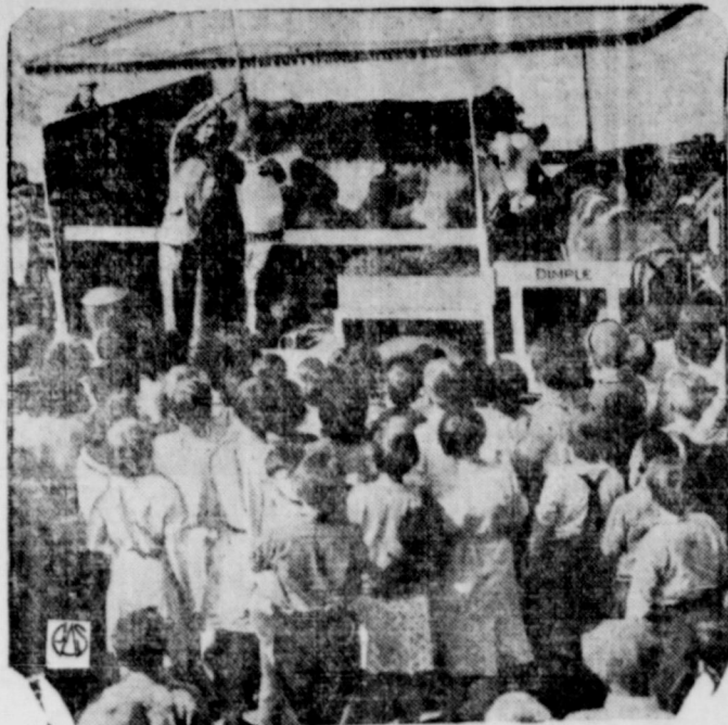
The Los Angeles Board of Education is now taking Bossie and her calf for a ride—a ride around to all the schools in the city—and all because a recent survey disclosed that there were thousands of city school children who had never seen a cow—a calf or a churn. The caravan is shown here at its first stop.