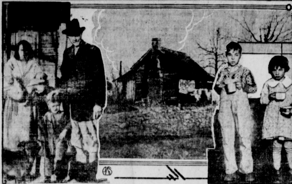
A larger proportion of the stricken families who are being fed and clothed by the Red Cross live in homes like the one in the center. A typical family is shown here, and two children who have been saved from starvation.