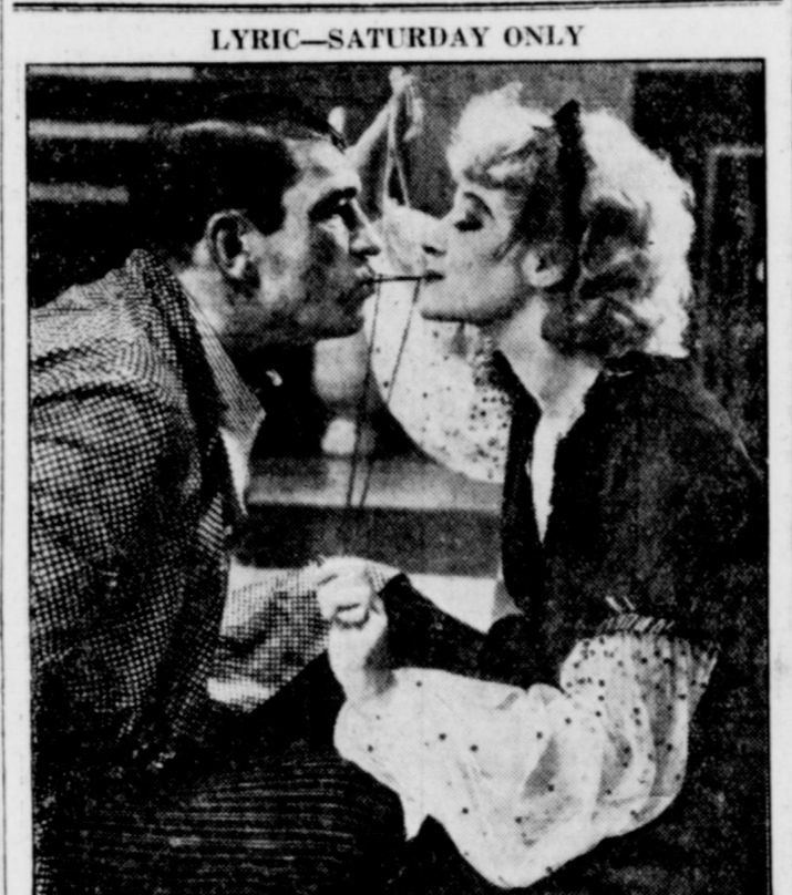
Victor McLaglen here gives the first graphic illustration of what is commonly called "going ga-ga," as the lovely Greta Nissen works her wiles. They have the leading roles in "Rackety Kax," the new Fox comedy of rah-rah racketeers and frantic football.

Toombs & Richardson Drug Co. East Side Square Eastland