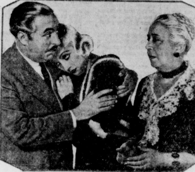
Walter Connolly, Carole Lombard and Louise Closser Hale in "No More Orchids"—A Columbia Picture