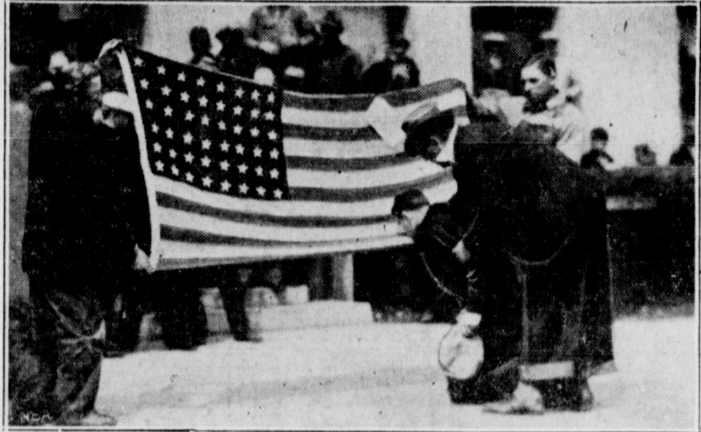
Rioting Iowa farmers, fighting foreclosures, are pictured here in one of the acts of violence that resulted in martial law for two counties.

organizing "The Radio Program Foundation," and announcing that they were applying for corporate papers in Delaware. One of the purposes of the National Association of Broadcasters' "Radio Program Foundation," according to the announcement, is "to make available to broadcasters the copyrighted works of independent composers and authors, to acquire copyrights therein," etc.