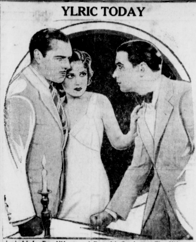
Jack Holt, Fay Wray and Donald Cook in "The Woman I Stole"—A Columbia Picture