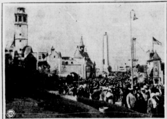
Old World and New

a penny to 15 cents to explore the Magic Mountain, or ride on the miniature railroad, or be amused by any one of a score of attractions designed for children only. Rooms From $1 Up The visitor may see 12,000 free exhibits. It is estimated that the fair's winding aisles and corridors, if placed together, would extend more than 82 miles. Also there are numerous concessions for which admission is charged, which would total perhaps $75, with the added luxury of a riksha, a boardwalk chair, or a gondola. If pennies must be watched, cost can be cut by staying in a private home or apartment. A recent survey showed that the city has 400,000 rooms available, ranging in price from $1 a day in private homes to $25 a day for de luxe suites in Michigan boulevard hotels. Close by Grant Park, site of the exposition, are several first-class hotels which are offering double rooms without bath for $3 a day, or single rooms for $2. With bath, double rooms are available for $4 and single rooms for $2.50. Railroad Rates