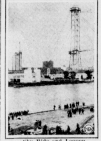
Sky Ride and Lagoon