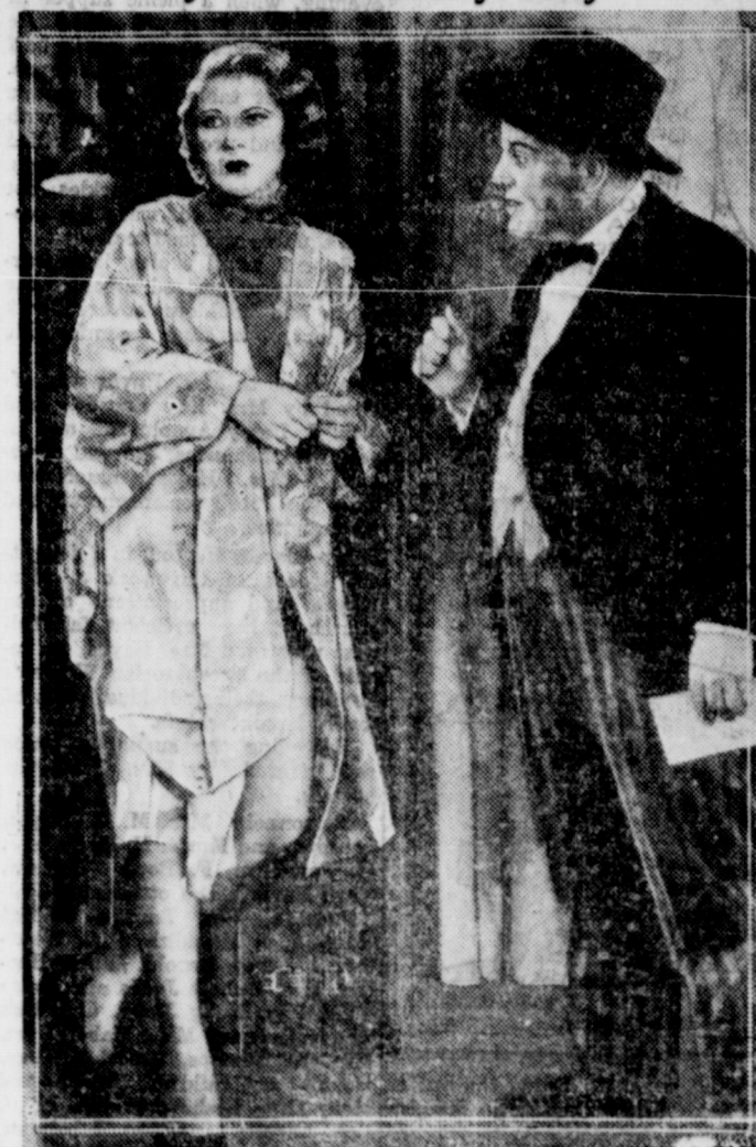
Ruth Chatterton and Guy Kibbee as they are seen in First National's exciting drama "Lilly Turner." The story deals with the hectic adventures of a wondering side show and serves as the most stirring screen vehicle Miss Chatterton has ever made.