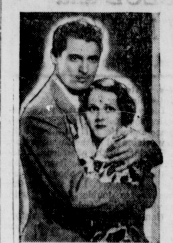
Bluff sponsors the romance between Cary Grant and Benita Hume in Paramount's drama of high-seas law-scoffing, coming Sunday to the Lyric theatre, "Gambling Ship."