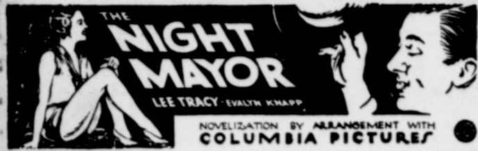
NIGHT MAYOR LEE TRACY-EVELYN KNAPP NOVELIZATION BY ARRANGEMENT WITH COLUMBIA PICTURES

Obituaries, cards of thanks, notices of lodge meetings, etc., are charged for at regular advertising rates which will be furnished upon application.