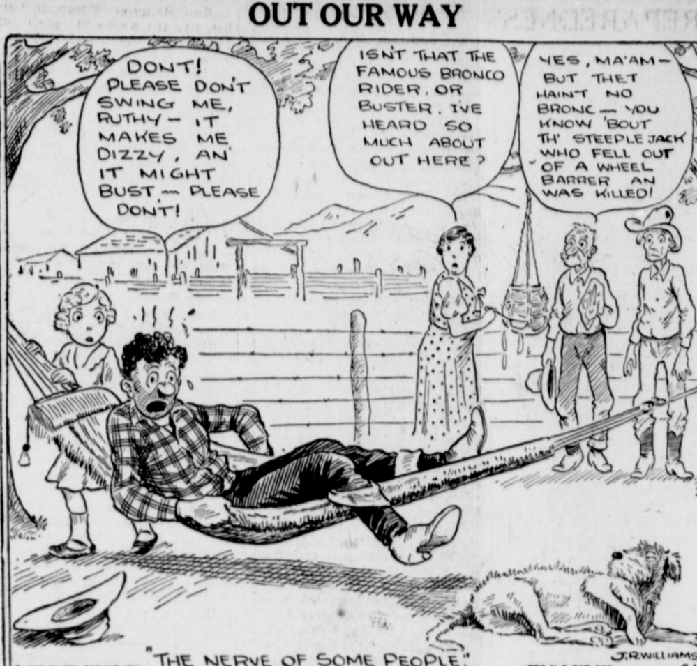
"THE NERVE OF SOME PEOPLE." REG. U. S. PAT. OFF. 2-1