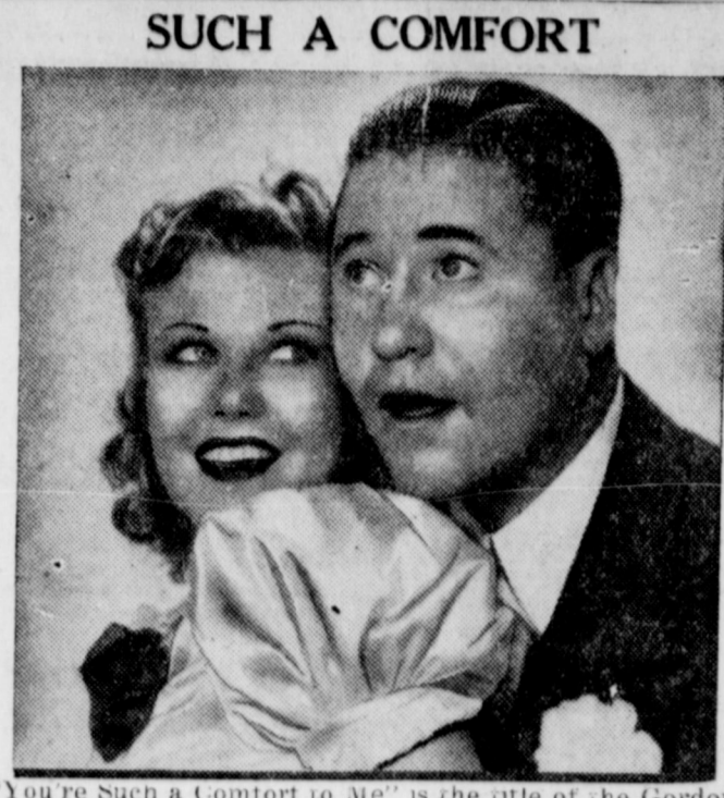
"You're Such a Comfort to Me" is the title of the Gordon-Revel tune which Jack Oakie is singing to Ginger Rogers in this scene from Paramount's "Sitting Pretty." It comes on Thursday to the Lyric Theatre. The picture, directed by Harry Joe Brown and produced for Paramount by Charles R. Rogers, contains nine other songs by Gordon and Revel who will be remembered for "Underneath the Harlem Moon" and "An Orchid to You."