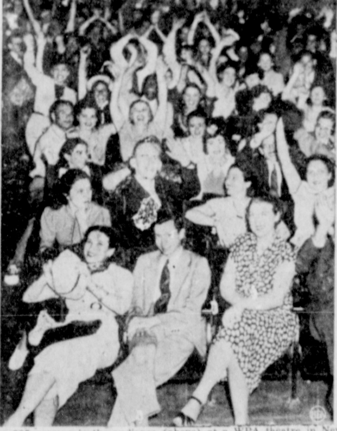
The 800 persons in the audience (above) at a WPA theatre in New York whoop it up as they join in an all-night sit-down strike to protest the threatened dismissal of nearly 25 per cent of the WPA workers on a music project. The night air chilled their ardor, though. By midnight the crowd was halved, by dawn only a few stragglers remained in the theatre.