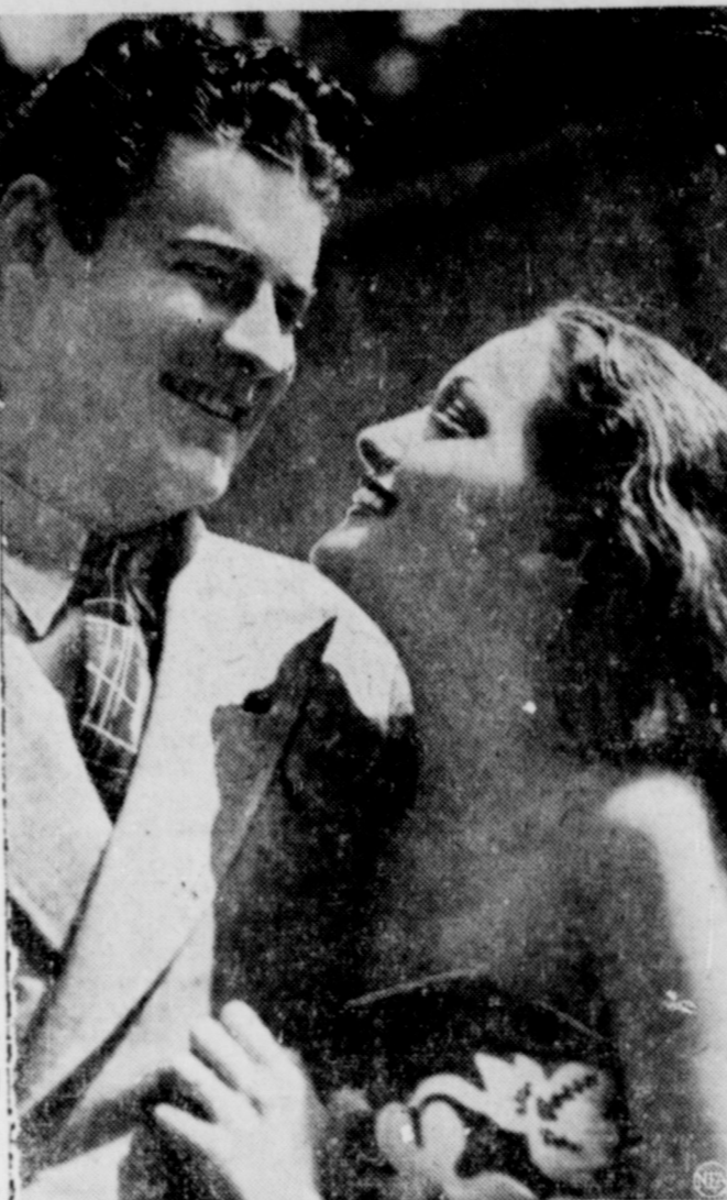
They had adoring eyes for each other when this picture was taken, but now Dorothy Lamour, sarong-famous actress, and her orchestra leader-husband, Herbie Kay, are seeking a Hollywood "friendly" divorce. Their reason: marriage and careers don't mix.