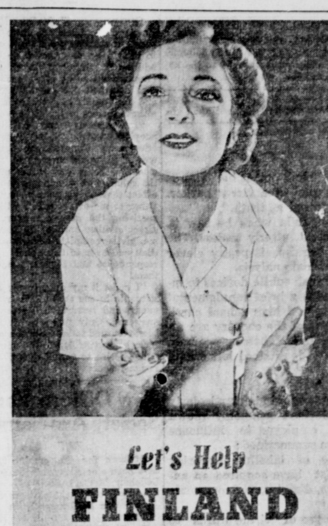
HELEN HAYES, one of America's foremost actresses, posed for this poster to aid the Finnish Relief drive headed by former president Herbert Hoover.