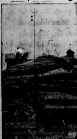
Two big red balls hoisted on a hill near Chungking give warn-ing when Jap bombers are but a half hour away. Then Chinese

The stealing of cattle and chickens is on the increase in