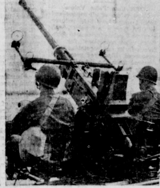
Congress was jolted when it found wooden guns, left, atop some of the capital buildings, but the Army now reveals that modern weapons like 40-mm. Bofors, right, now protect Washington.