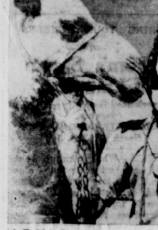
A British flyer gets the lowdown on this desert life from a pair of conversational natives. The camel has played an important war role in North Africa despite jerps, tanks and planes.