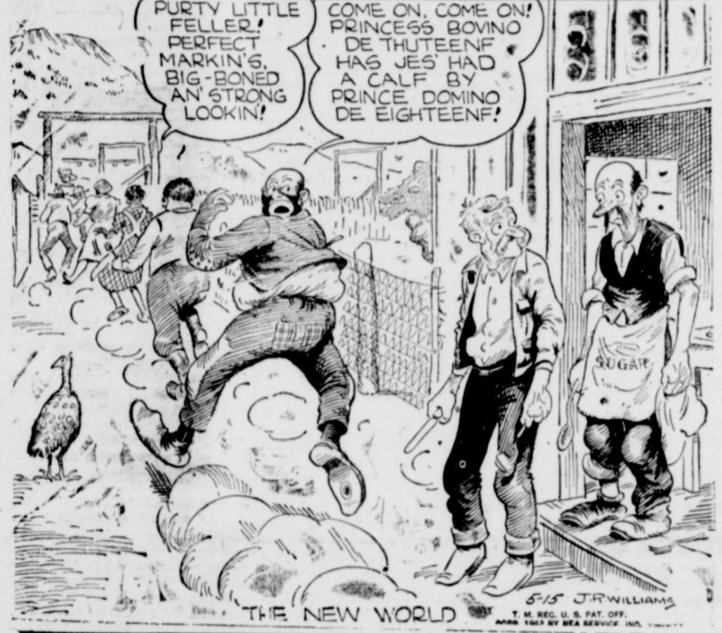
REG. U. S. PAT. OFF. THE NEW WORLD