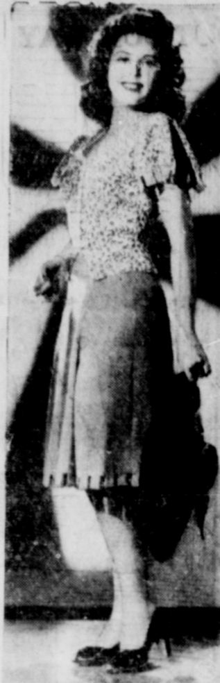
ANN MILLER, Columbia star, couples comfort with style in his new two-piece outfit. The rug-waisted, multi-colored embroidered jacket's sleeves are fringed with little squares, which are repeated at the hem of the trousers.