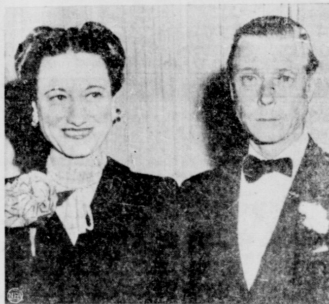
Visitors in New York again are the ever-attractive Duchess of Windsor and the Duke, whose face begins to betray his years.