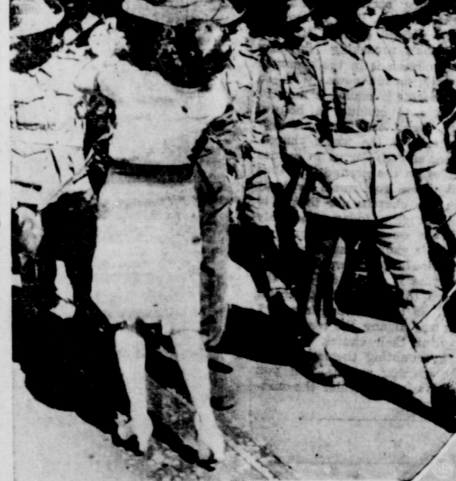
Thrilled Australian lass-breaks into parade to give her man a hug and a kiss as Aussie division arrives in Melbourne from the Middle East.