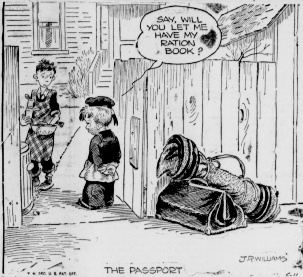
REG. U. S. PAT. OFF. THE PASSPORT