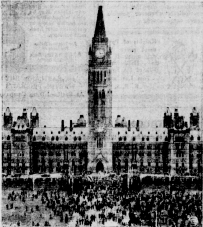
This is the Parliament Building in Ottawa, capital of Canada, where President Roosevelt made an open air address to the Canadian legislators. He spoke from the front steps of the building.