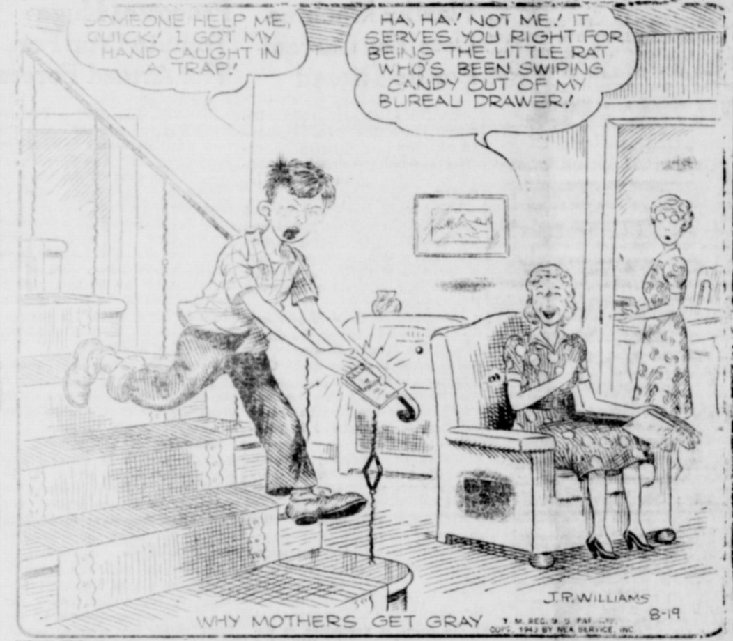
WHY MOTHERS GET GRAY J.R. WILLIAMS