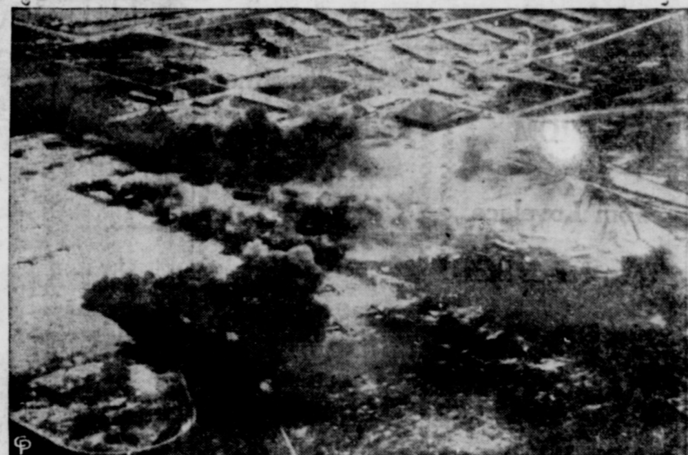
UP IN SMOKE go Japanese bombers on the Shinchiku airdrome on the island of Formosa, southwest of Japan proper. The bombers were set afire by a low-level fighter plane attack before the U. S. Fourteenth Army Air Force bombers made their bombing runs over the target. U. S. and Chinese planes are expanding their operations in China.