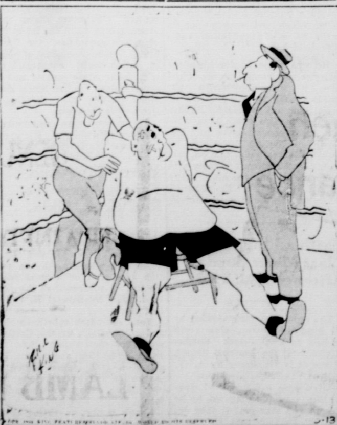
"I certainly admire your courage, Boss. For me, I'm ready to quit!"