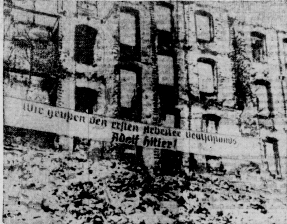
THIS STREAMER put up by Propagandist Josef Goebbels in observance of Adolf Hitler's 55th birthday reads, translated, "We Greet the First Worker of Germany—Adolf Hitler." Ironically, the streamer decorates the shell of a bombed out Berlin building, symbol of Allied air supremacy.