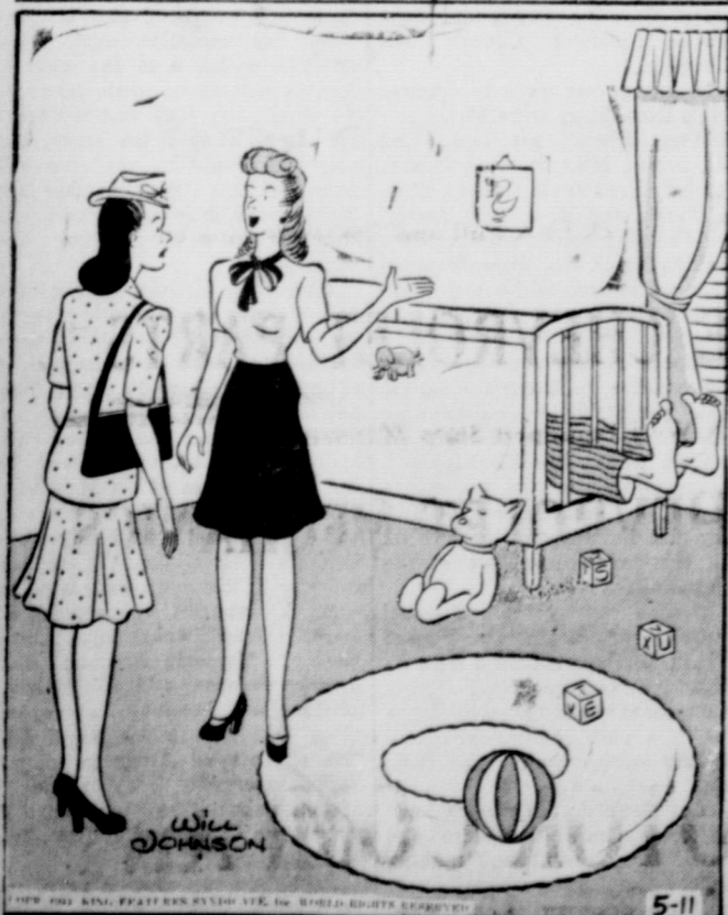
"Don't get excited. Junior just likes for his father to go to sleep with him!"