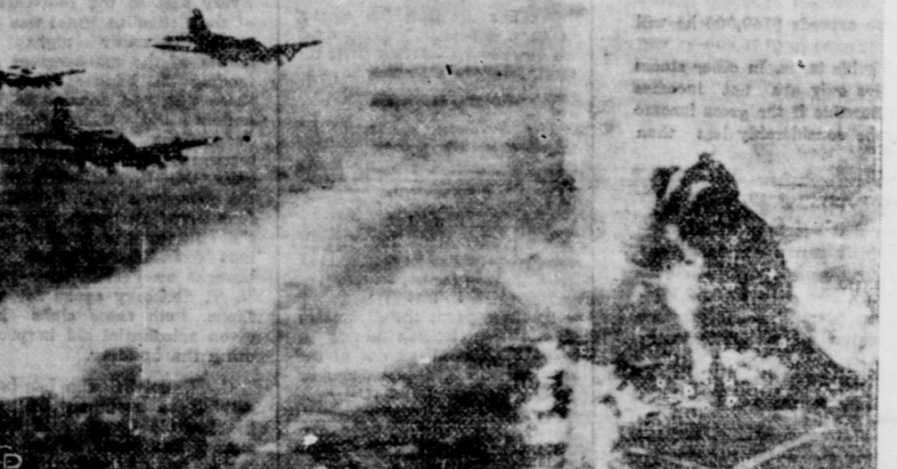
AMERICAN BOMBING PLANES deal a blow to the German bomber base at Avord, near Bourges, France. This was the base for Nazi anti-airship patrols in the Bay of Biscay.