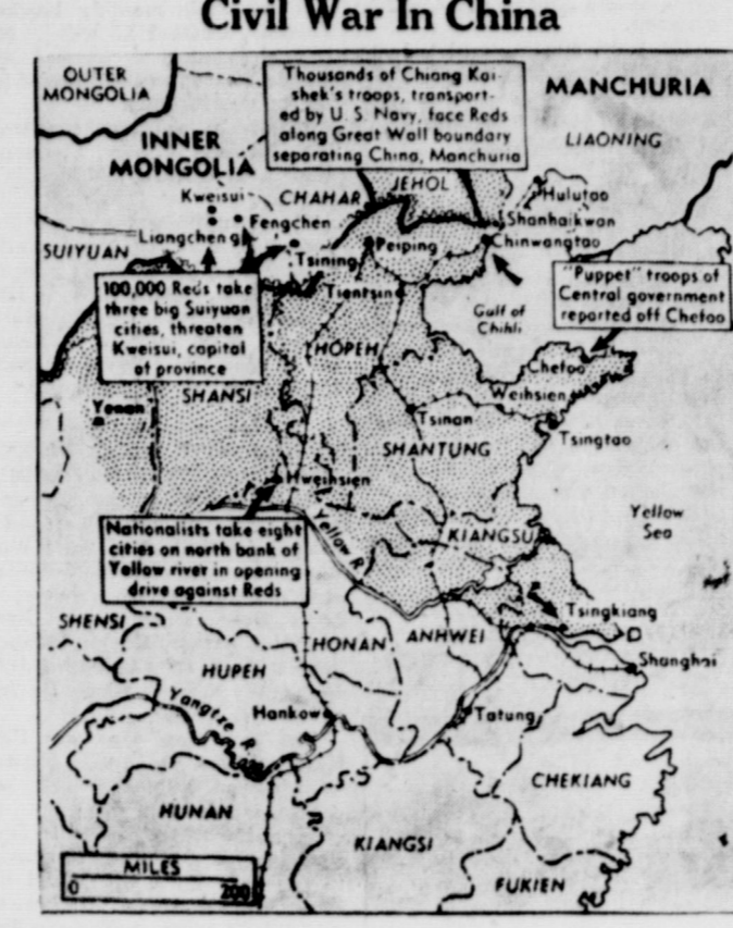
Civil War In China This NEA telemap shows the situation in China and Manchuria as Nationalists and Communists clash on widely separated fronts.