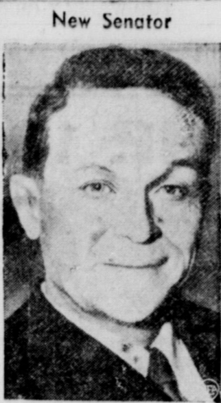
James W. Huffman, above, state director of commerce, is the new senator from Ohio appointed by Gov. Frank J. Lausche to take over the post vacated by Senator Burton's appointment to the Supreme Court.