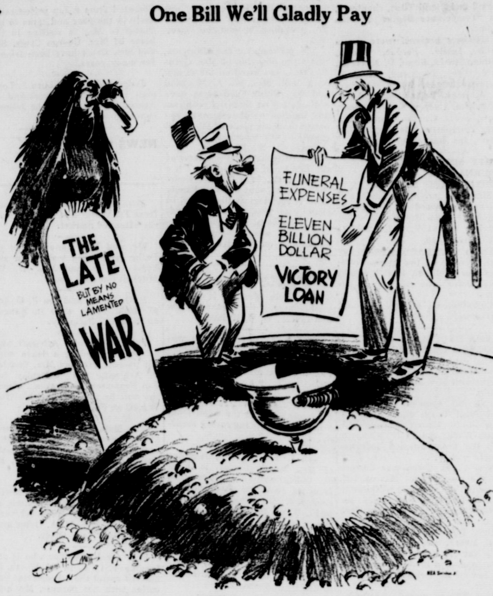
One Bill We'll Gladly Pay

Overseas 40 months, the colonel has seen service in Australia, New Guinea, the Netherlands East Indies, the Philippines and Okinawa.