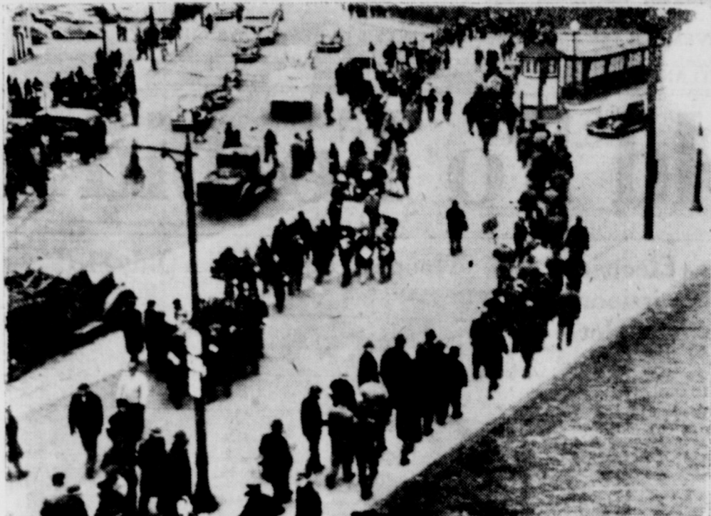
A picket line of about 2,000 General Electric workers lined in front of the main gate to the Schenectady plant of General Electric as a general walkout of United Electrical workers began. The Electrical Workers are demanding a $2.00 per day wage increase.