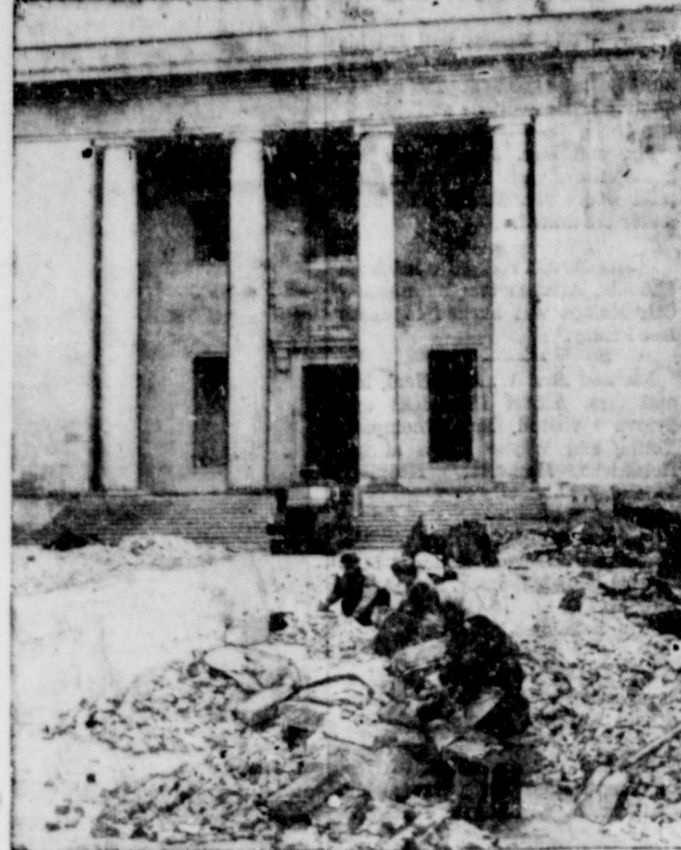
In front of Hitler's Reich Chancellery, in the Russian sector of Berlin, women workers tear up paving stones. They'll be used to reconstruct buildings for the Russian-sponsored "People's Council," the Soviet's new government for East Germany. The Reich Chancellery's costly Italian marble and mosaics are also being torn out, and will go into a memorial to the Red Army.