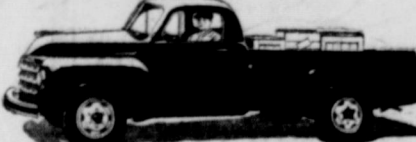
America's most distinctive truck styling! Shown is a new Studebaker 1/2-ton pick-up. There's a 1/2-ton and 1-ton also. Automatic overdrive and easy-ride 2-stage rear springs—Studebaker truck exclusives—are available at extra cost on 1/2-ton and 1-ton models.