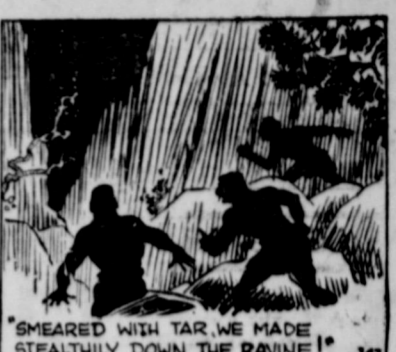
SMEARED WITH TAR, WE MADE STEALTHILY DOWN THE RAVINE!