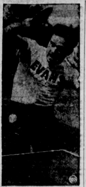
PING-PUNCH —Marcel Cerdan counters with a table tennis shot at Loch Sheldrake, N.Y. France's world middle-weight champion is training for his title defense against Jake LaMotta in Detroit, June 15.