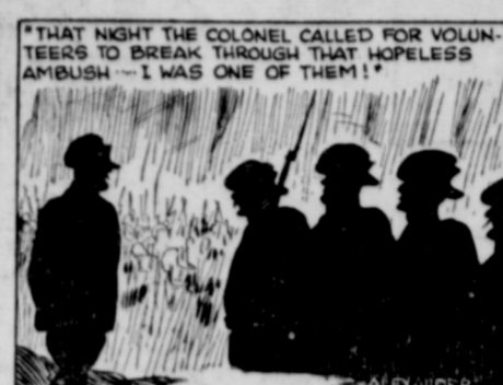
THAT NIGHT THE COLONEL CALLED FOR VOLUNTEERS TO BREAK THROUGH THAT HOPELESS AMBUSH—I WAS ONE OF THEM!