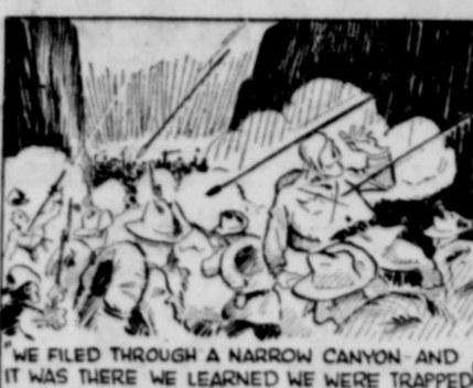
WE FILED THROUGH A NARROW CANYON—AND IT WAS THERE WE LEARNED WE WERE TRAPPED!