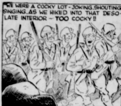
WE WERE A COCKY LOT—JOKING, SHOUTING, SINGING, AS WE WIKED INTO THAT DESOLATE INTERIOR—TOO COCKY!!