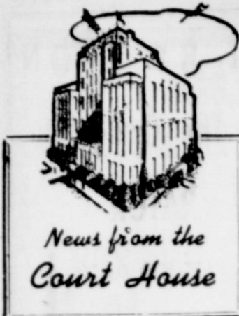
News from the Court House