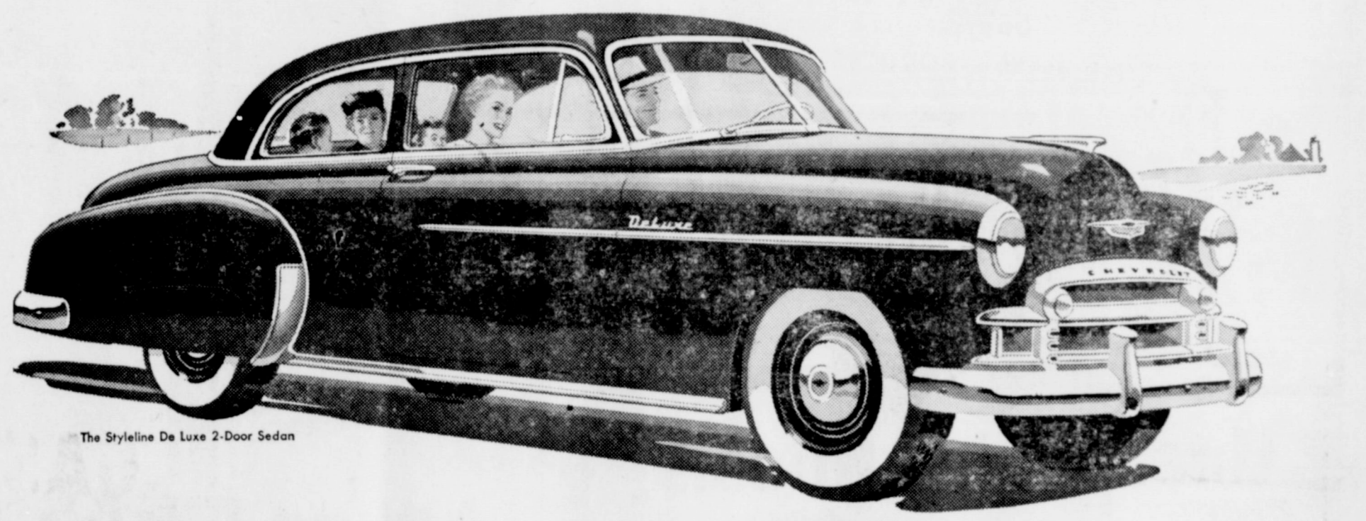
The Styleline De Luxe 2-Door Sedan