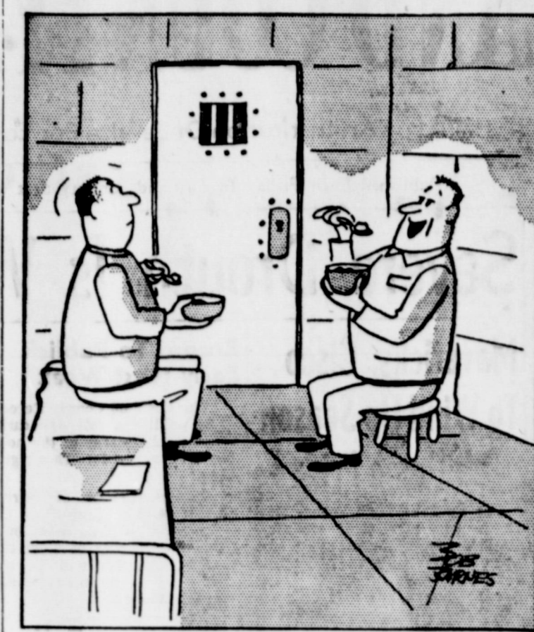
"I'll Say One Thing - It's Darn GOOD Bread And Water!"