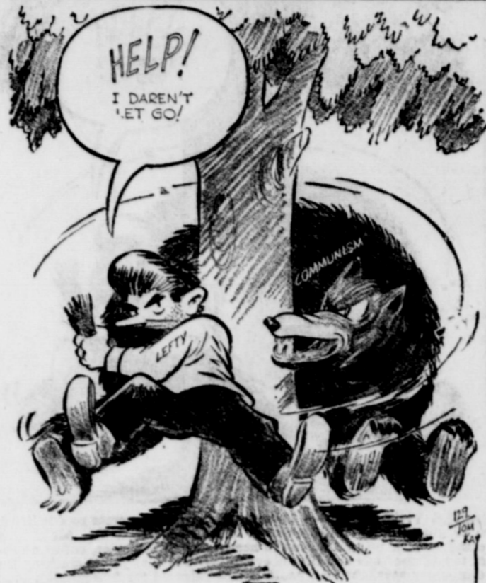
A Bear, Not A Bull, By The Tail