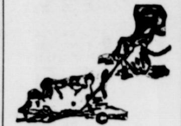
CENTRAL HIDE AND RENDERING CO.

Your Local USED-COW Dealer Remove Dead Stock FREE For Immediate Service PHONE 141 COLLECT Eastland, Texas