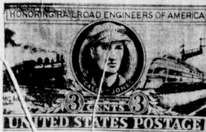
"CASEY" HONORED—A three-cent stamp honoring the Railroad Engineers of America will go on first-day sale at Jackson, Tenn., April 29. Design features a portrait of the legendary "Casey" Jones superimposed on a locomotive wheel.

Oslo, capitol of Norway, was founded by King Harald the Hard 900 years ago.