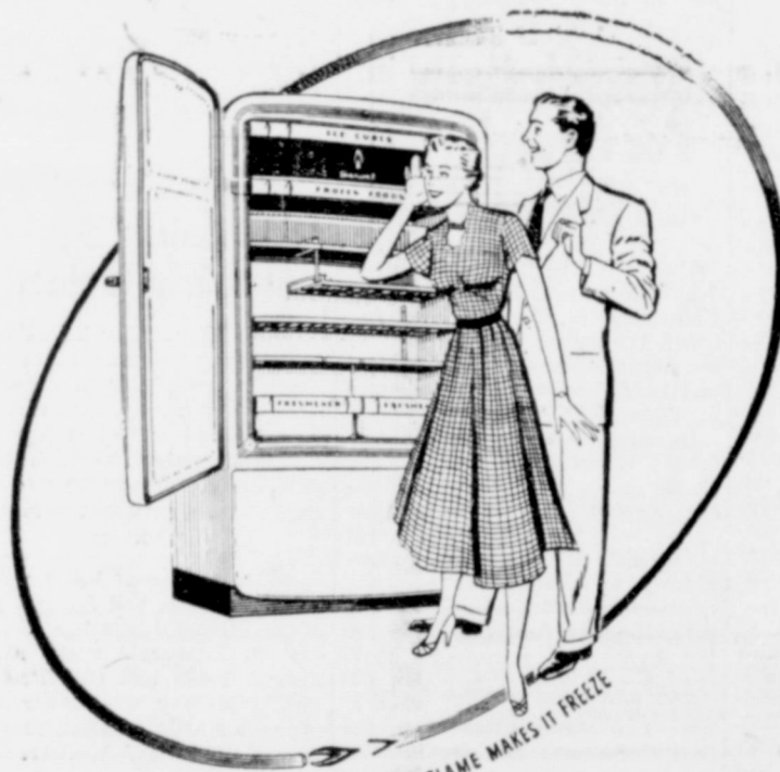
A DEPENDABLE JET OF GAS FLAME MAKES IT FREEZE