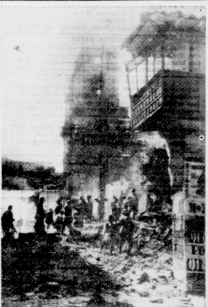
EARTHQUAKE DAMAGE IS HEAVY —Civilians and soldiers search ruins in the city of Cuzco, Peru, following a disastrous earthquake. This city of 45,000 persons was 90 per cent destroyed by the heavy quake. (NEA Telephoto).

Sen. Tom Connally, chairman of the Senate Foreign Relations Committee, will introduce the secretary.