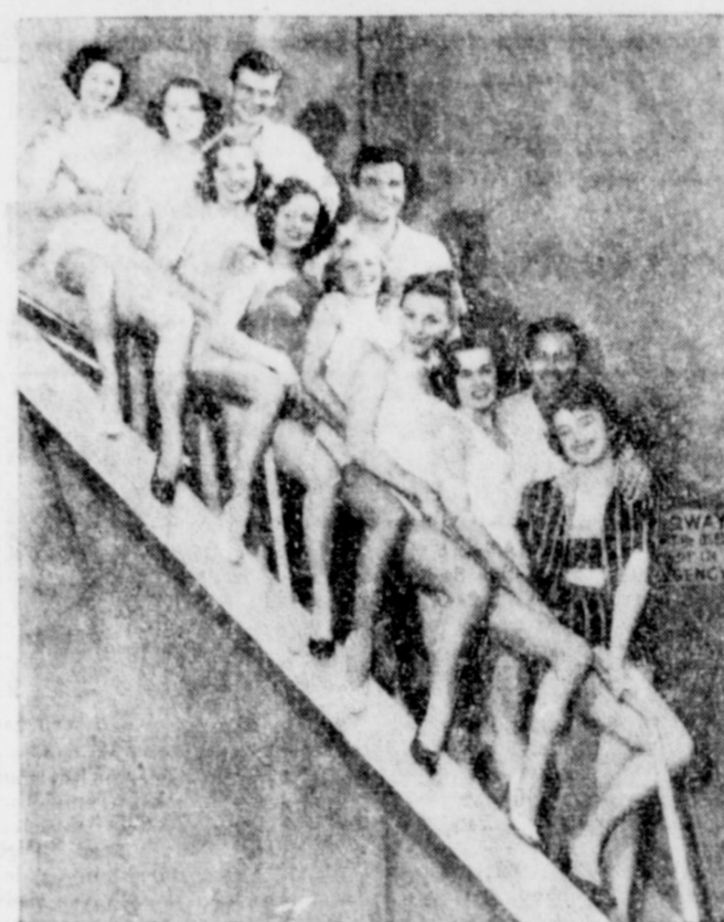
"GOLDEN CIRCLE" PLAYERS