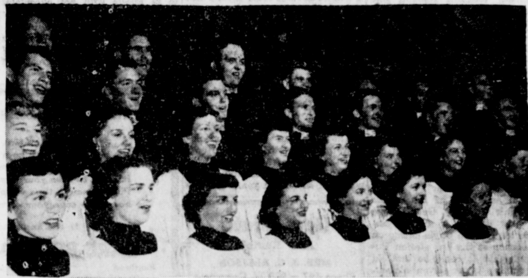
H-SU a Cappella Choir composed of 55 voices, will sing in Eastland on Wednesday of next week. The program will be rendered at High School auditorium.

For Good Used Cars — Trade-ins on the New Olds! Osborne Motor Company, Eastland