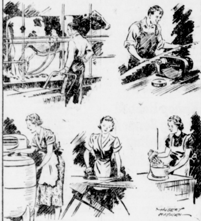
THIS VAST NETWORK OF POWER HAS LESSENED LABOR, SPEEDED PRODUCTION AND RAISED LIVING STANDARDS ON THE FARMS OF OUR DEMOCRACY. IT HAS BEEN CREATED BY TRADITIONAL AMERICAN INDUSTRIAL INGENUITY, BACKED BY THE SAVINGS OF THE PEOPLE.

IN 1923, THE FIRST EXPERIMENTAL POWER LINE WAS STRUNG NEAR RED WING, MINNESOTA - 6 MILES OF WIRE, CONNECTING 15 FARMS... TODAY, A YOUNG GENERATION LATER, 4900,000 OF 5,200,000 OCCUPIED FARMS ARE ELECTRIFIED.