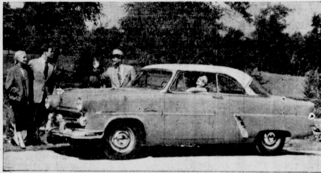
The new 1952 Ford "Victoria" is a member of the Ford Crestline which also includes the Sunliner convertible and the Country Squire station wagon. The Victoria combines unobstructed side visibility and open-car advantages of a sports vehicle with the all-weather protection of steel sedan top construction. It is available in a wide variety of interior trim, upholstery and solid or two-tone body colors.

JANUARY 2-31 GIVE Voluntarily TO MARCH OF DIMES