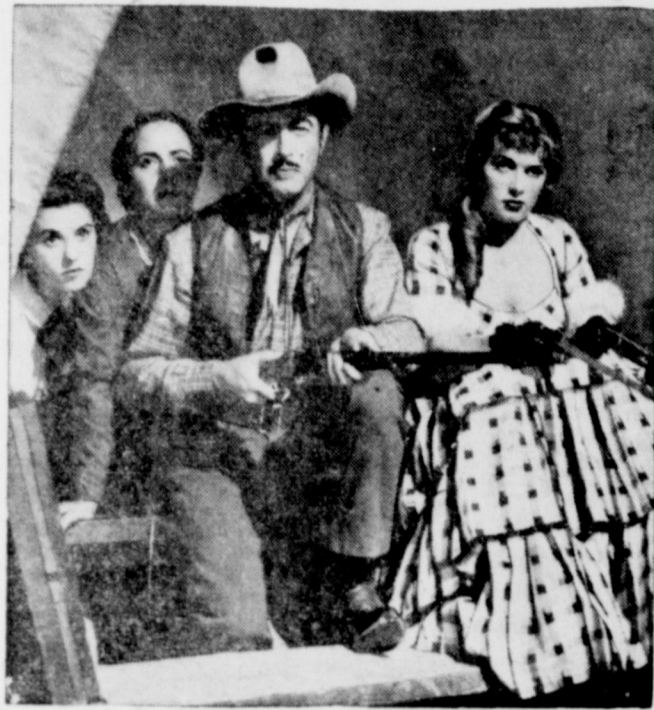
M-G-M presents "Westward The Woman", Palace Theatre Cisco, with Robert Taylor. Wednesday, Thursday and Friday.