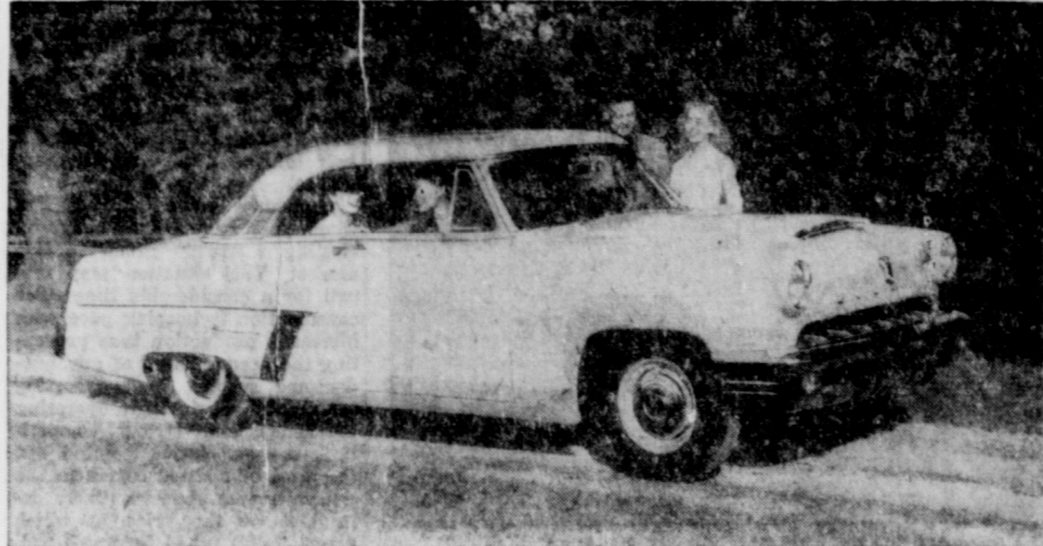
Completely new body styles are offered by Mercury for 1952, including the custom sport coupe with "hardtop" body illustrated here. Distinctive styling is achieved by a high prominent fender line, low flat hood contour with air-scoop-like projection and a massive wrap-around double front bumper. The attractive appearance of the 1952 Mercury is further enhanced by a one-piece curved windshield, an extra-large rear window and luxurious interior upholstery and trim. A more powerful V-8 engine developing 125 horsepower and a stronger chassis are featured.