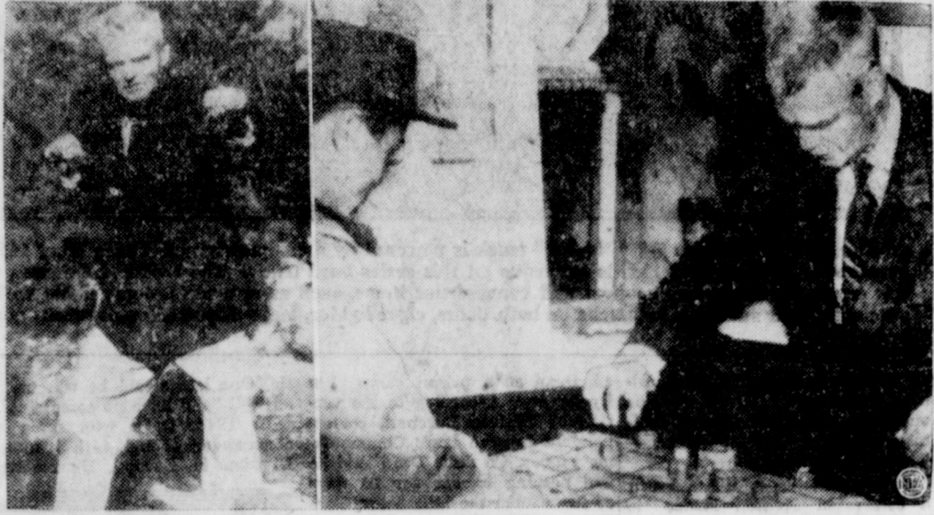
KEEPING FIT: Maj. Gen. William F. Dean, former commander of the US 24th Division and Congressional Medal of Honor winner who was captured by the Reds August 25, 1950 and is being held by the communists in a POW camp in Pyongyang, Korea, keeps in trim by shadow boxing, left, and relaxes over a game of Korean chess with one of his guards, right.