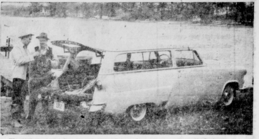
The 1952 Ford Mainline "Ranch Wagon" is a six-passenger utility vehicle for business or pleasure, in city or country. It has passenger car styling and station wagon conveniences, plus six power combinations. The Ranch Wagon is available with the Ford Mileage Maker Six or Strato-Star V-8 engine with a choice of the conventional transmission, Ford overdrive or Fordomatic—Ford's automatic transmission.