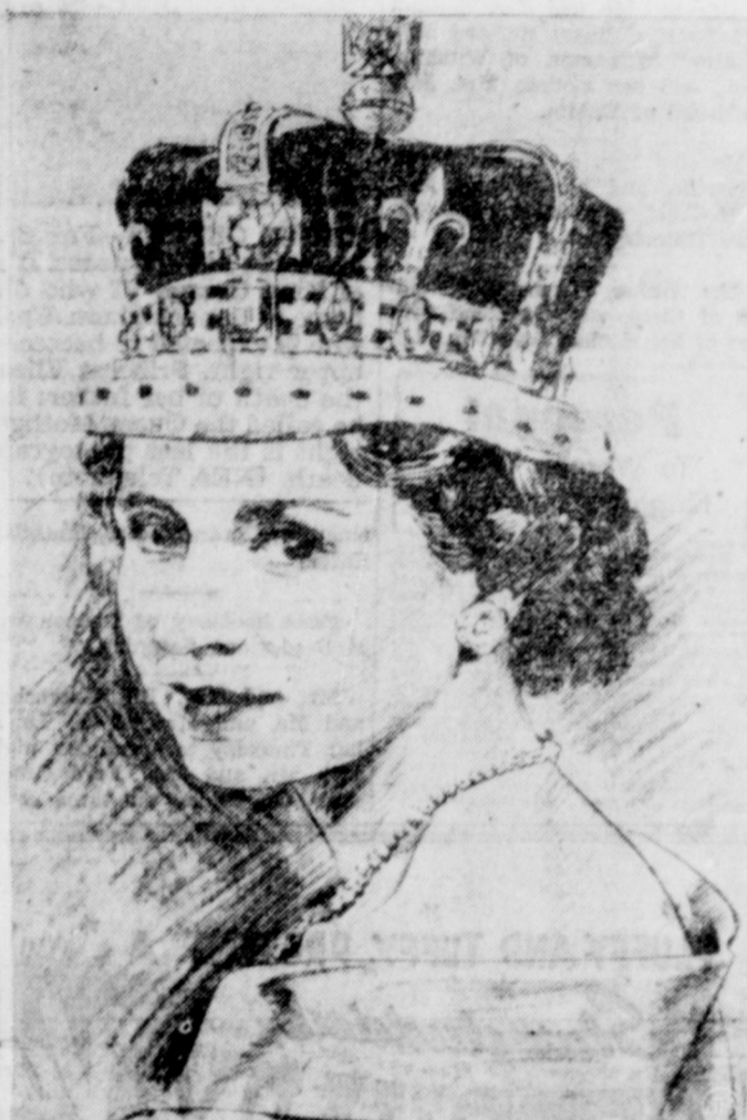
EXCLUSIVE NEA SKETCH OF NEW QUEEN—Here is how Queen Elizabeth, Great Britain's new ruler, will look upon her official coronation when, for the first time, she wears the royal crown. The drawing was made from a photo portrait by Karsh of Ottawa, with the royal crown added by the sketch artist.

The stowaway, a black and tan mongrel, was discovered one day out of New York. During the voyage Blackie hobnobbed with dogdom's aristocracy in the top deck kennels. If no one claims him he will become the ship's mascot.