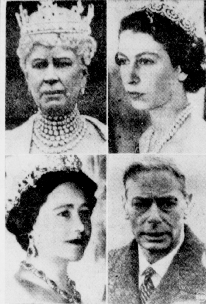
THREE QUEENS —For the first time in history, Britain has three living Queens. It was brought about by the death of King George VI who died in his sleep at his country home at Sandringham. Upper left, 84-year-old Queen Mary who is expected to become known as the Dowager Queen; upper right, Princess Elizabeth who became queen upon the death of her father; lower left, Queen Elizabeth may be called the Queen Mother by British Subjects; and lower right is the last photograph made of the King before his death.

Nagging backache, loss of pep and energy, dizziness and depression may be due to slow-down of kidney function. Doctors say good kidney function is very important to good health. When some everyday condition, such as stress and strain, causes this important function to slow down, many folks suffer from nagging backache—fatigue, muscular aches, dizziness, irritability due to cold or wrong diet may also be "set off" your kidneys if these conditions occur too often. Try Doan's Pills—a mild diuretic. Used sparingly or millions for over 50 years. It's amazing how many times Doan's give happy relief from these distressing signs—their kidneys and filters flush out waste. Get Doan's Pills today!