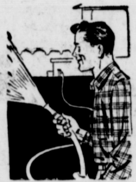
Adequate Water Supply

Approval Of The $1,500,000 Bond Issue Proposed By The Eastland County Water Supply District Means The Citizens Of That District Wish To Join Other Areas In Growth And Progress.