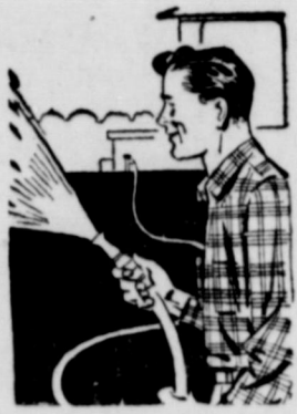
Adequate Water Supply

USE IT WISELY Approval Of The $1,500,000 Bond Issue Proposed By The Eastland County Water Supply District Means The Citizens Of That District Wish To Join Other Areas In Growth And Progress.