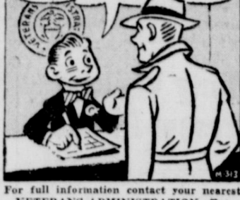
For full information contact your nearest VETERANS ADMINISTRATION office

VETERANS WITH SERVICE-CONNECTED DISABILITIES AND SPANISH-AMERICAN WAR VETERANS MAY RECEIVE OUT-PATIENT TREATMENT AT VA EXPENSE... NON-SERVICE-CONNECTED CASES ARE NOT ENTITLED TO THIS TYPE OF CARE